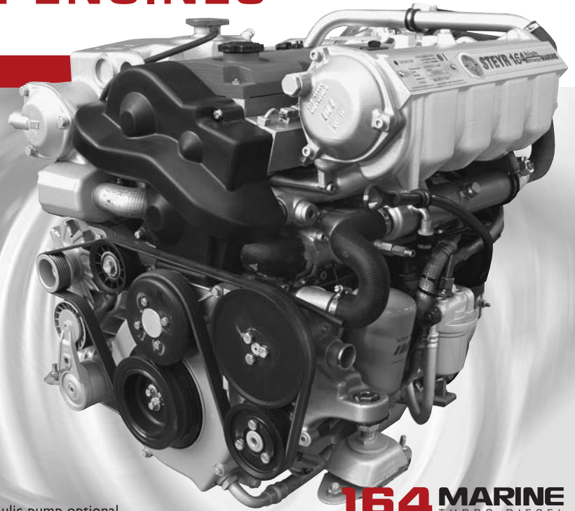
Hydraulic pump optional